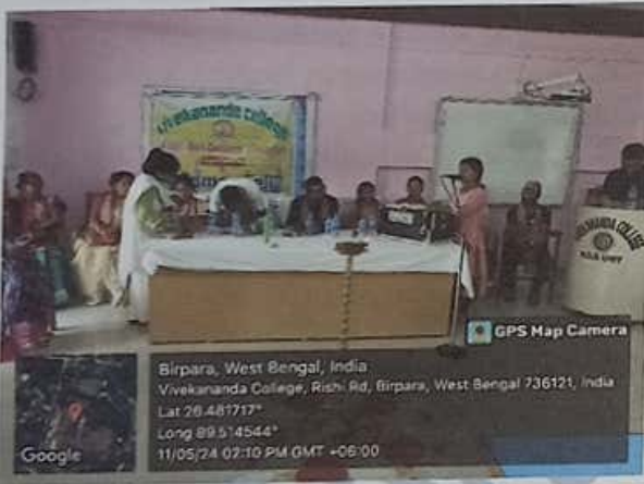
Birpara, West Bengal, India Vivekananda College, Rishi Rd, Birpara, West Bengal 736121, India Lat 26.481717° Long 89.514544° 11/05/24 02:10 PM GMT +06:00