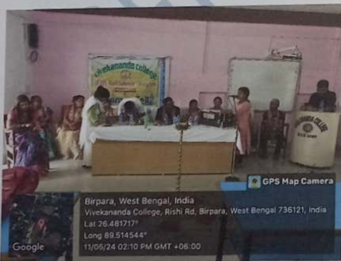
Birpara, West Bengal, India Vivekananda College, Rishi Rd, Birpara, West Bengal 736121, India Lat 26.481717° Long 89.514544° 11/05/24 02:10 PM GMT +06:00