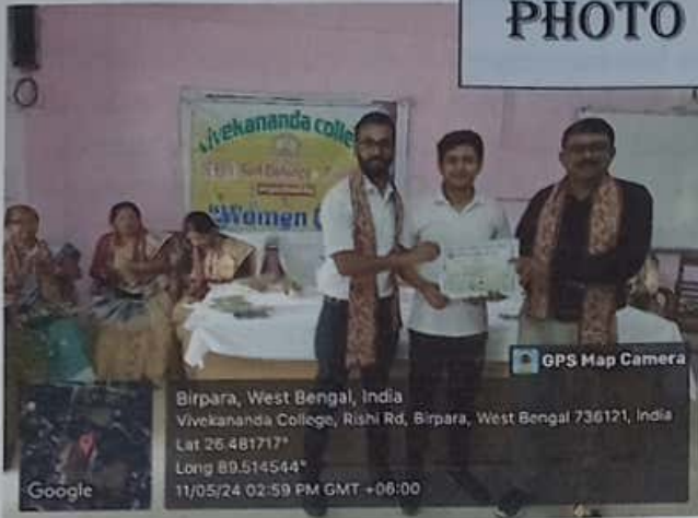
Birpara, West Bengal, India Vivekananda College, Rishi Rd, Birpara, West Bengal 736121, India Lat 26.481717° Long 89.514544° 11/05/24 02:59 PM GMT +06:00