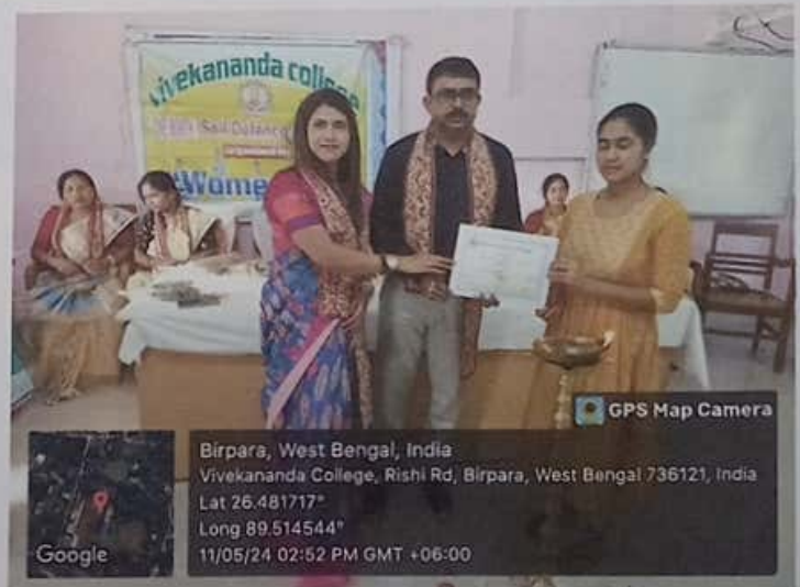
Birpara, West Bengal, India Vivekananda College, Rishi Rd, Birpara, West Bengal 736121, India Lat 26.481717° Long 89.514544° 11/05/24 02:52 PM GMT +06:00