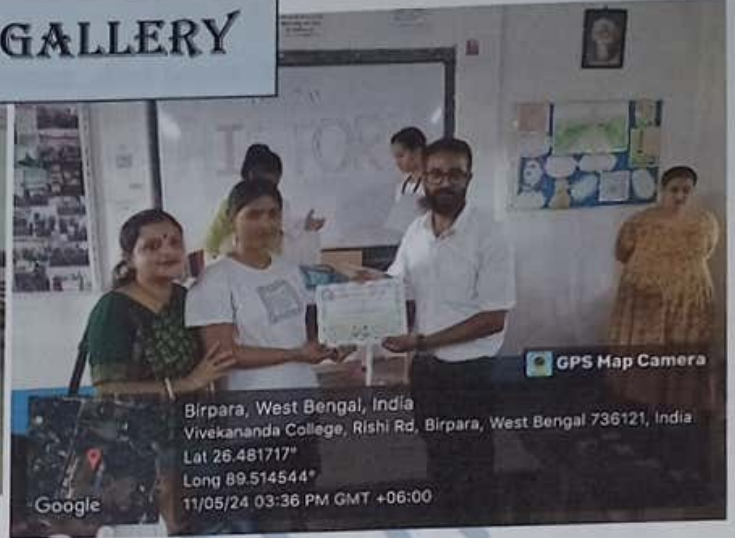
Birpara, West Bengal, India Vivekananda College, Rishi Rd, Birpara, West Bengal 736121, India Lat 26.481717° Long 89.514544° 11/05/24 03:36 PM GMT +06:00