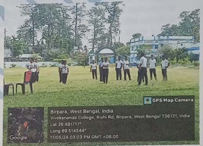
Birpara, West Bengal, India Vivekananda College, Rishi Rd, Birpara, West Bengal 736121, India Lat 26.481717° Long 89.514544° 11/05/24 03:03 PM GMT +06:00